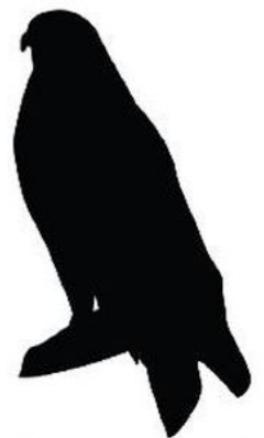
Red-tailed Hawk Length: 19 - 25 in Wingspan: 46 - 58 in