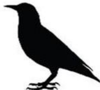
European Starling Length: 8.5 in Wingspan: 15.5 in