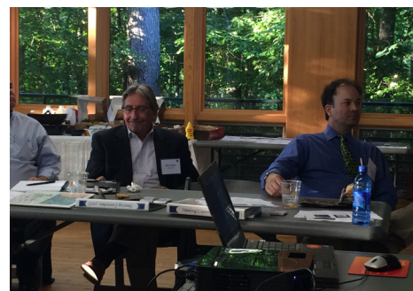
Website, Award-Winning Plan Video, and Charrette (top to bottom)