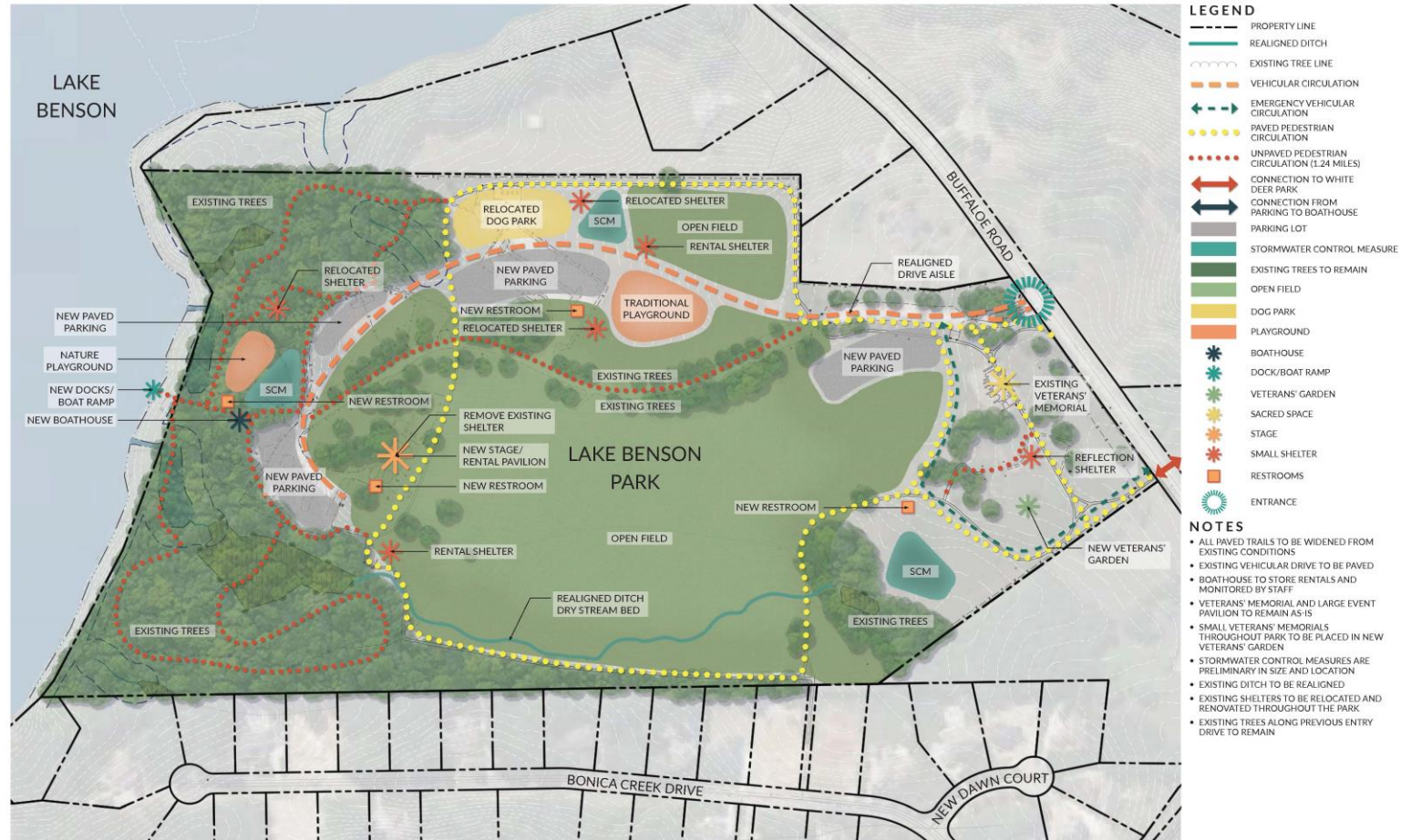
BUBBLE DIAGRAM: OPTION 3 LAKE BENSON PARK

SCALE 1" = 100' 0 100 200 WithersRavenel Our People. Your Success. Project No. 23-0032-002 | September 14, 2024