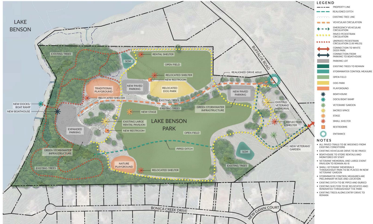
BUBBLE DIAGRAM: OPTION 2 LAKE BENSON PARK