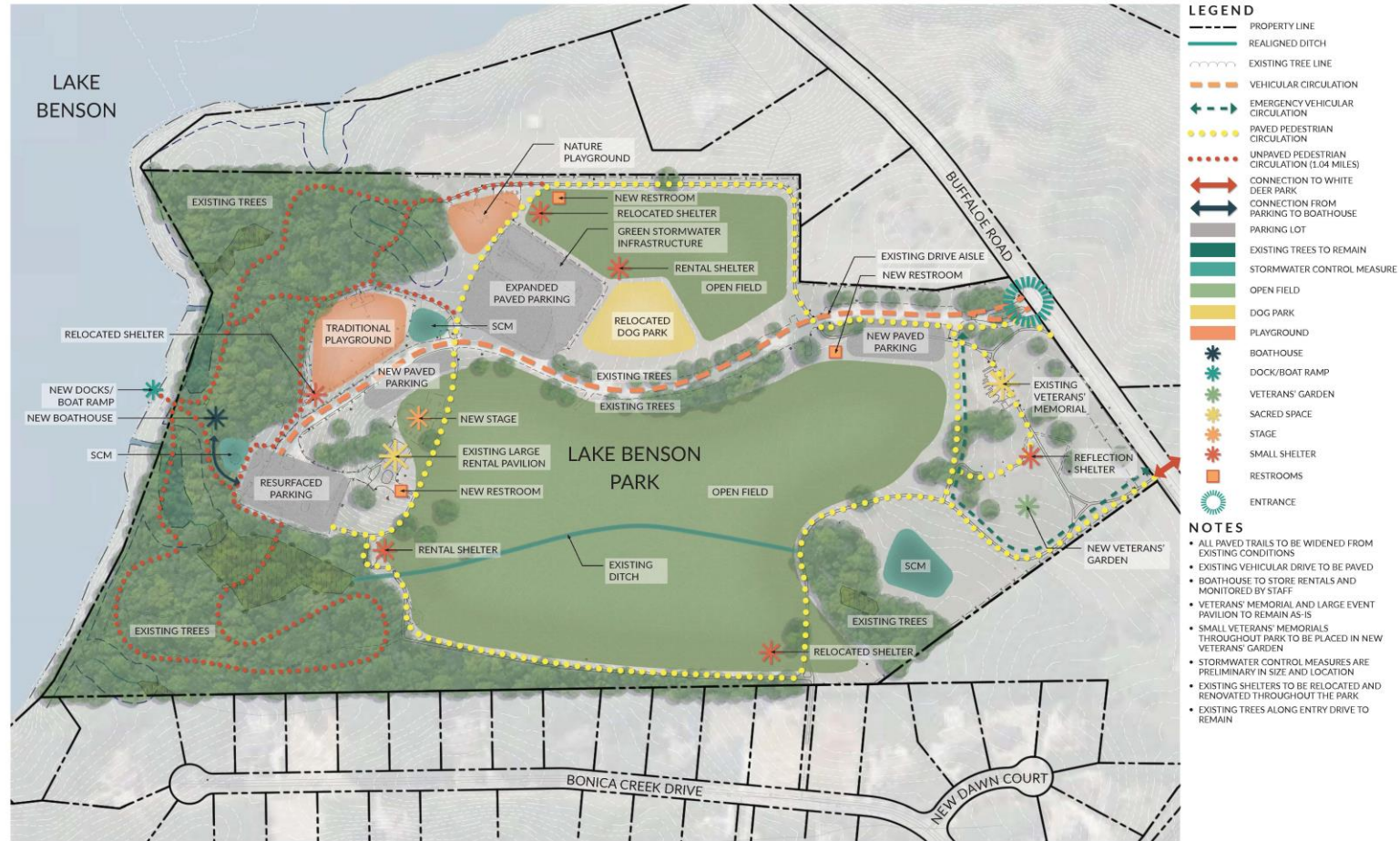
BUBBLE DIAGRAM: OPTION 1 LAKE BENSON PARK

SCALE 1" = 100' 0 100 200 WithersRavenel Our People. Your Success. Project No. 23-0029-002 | September 14, 2024