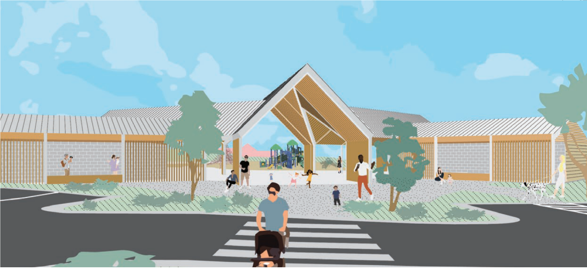
Shelter with Restrooms, Tables and Seating