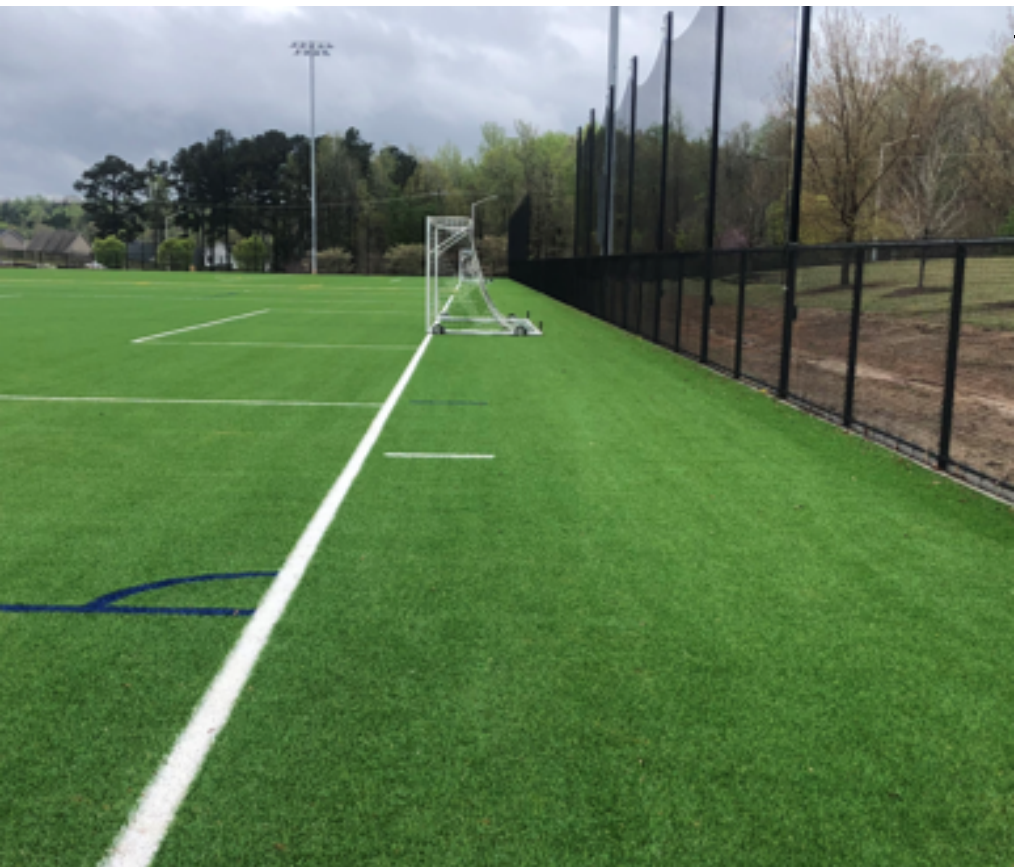
Artificial Turf Fields for Lacrosse and Soccer