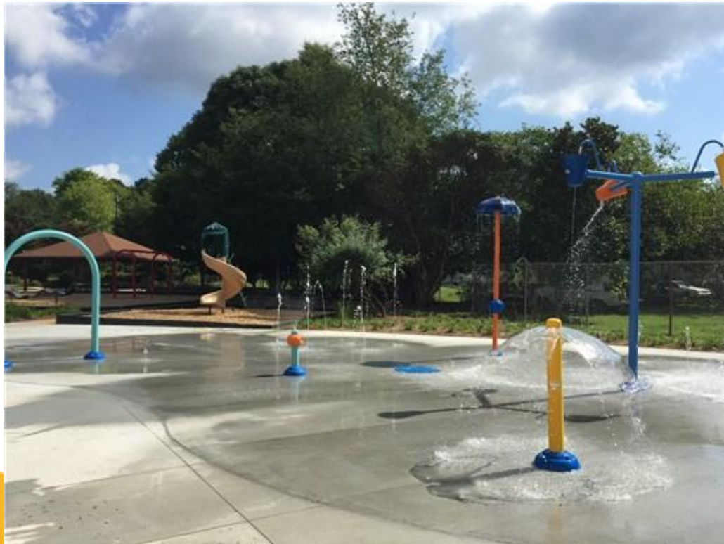
Wake Forest / Taylor Street Park