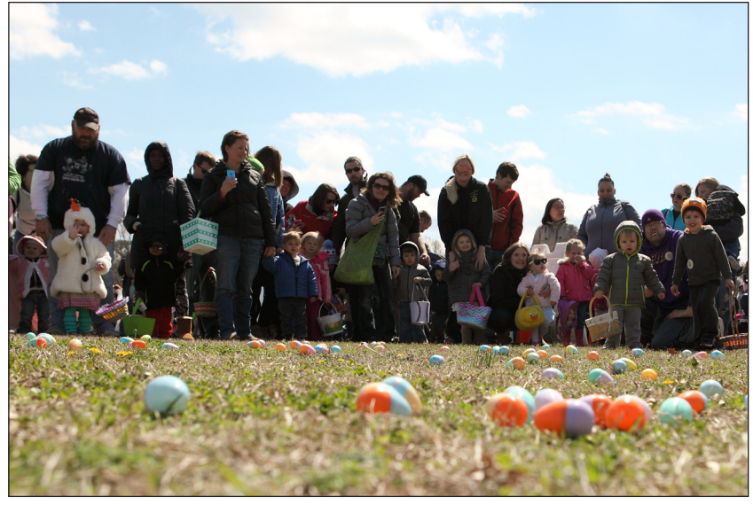
This year's egg hunts will start at different times—the first one of four occurring at 10:30 a.m.

In case of inclement weather, Spring Eggstravaganza will be rescheduled for Sunday, April 9 from 1-3 p.m.