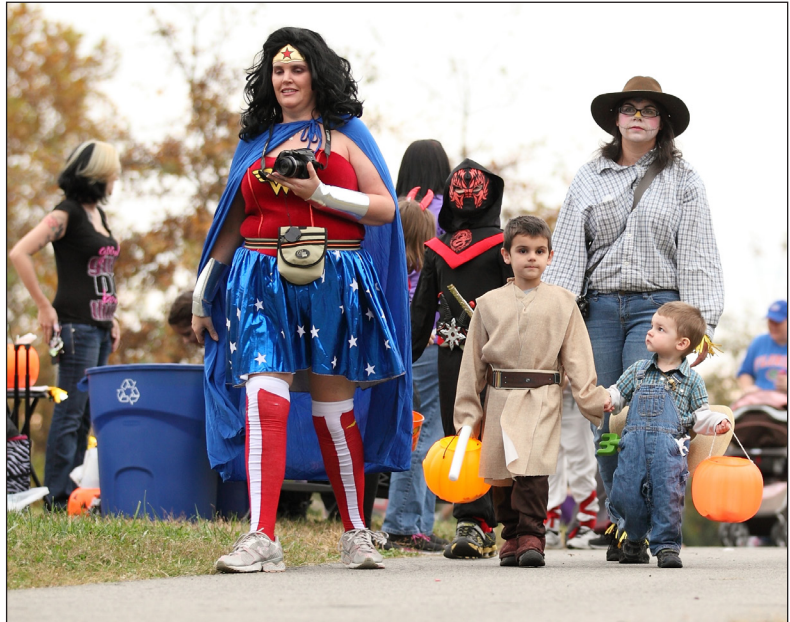
Four out of five superheroes choose to do their Halloween trick-or-treating at Trick-or-Treat the Trails in White Deer Park.

And make sure you get the wildly popular Trick-or-Eat Food Truck Rodeo on your calendar. It will be held this year on Sunday, Oct. 23 from noon to 5 p.m. Once again, the trucks will be lined up (mostly) along Main Street.