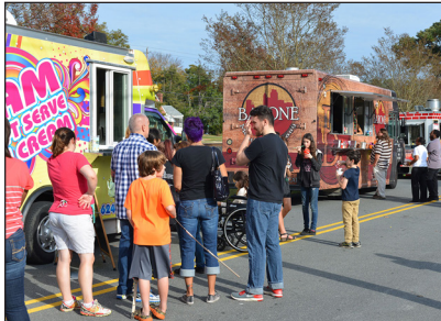
The incredibly popular Trick-or-Eat Food Truck Rodeo is set for Oct. 23 on Main Street.