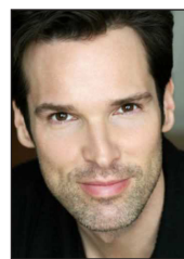
Hugh Panaro April 8, 7:30 p.m.

with the New York Festival of Song at Carnegie Hall, with the London Sinfonetta at Royal Festival Hall and with the Birmingham Symphony.