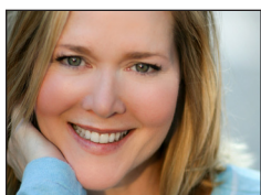
Rebecca Luker Nov. 12, 7:30 p.m.

Rebecca Luker received three Tony Award nominations for her work in "The Music Man," "Show Boat" and "Mary Poppins." She also appeared in the