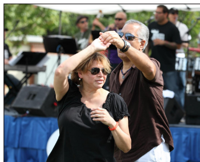
The fourth annual Carnival Latino promises another afternoon of music, food and fun.

salsa, merengue and more from Orquesta K'Che, Mexican pop